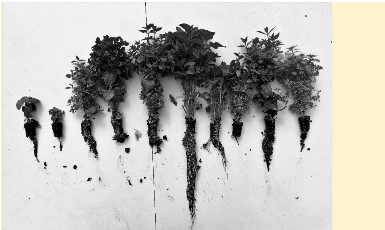
Figure 3. Variation in growth of peppermint individuals from the same block, by day 90 of observation period.