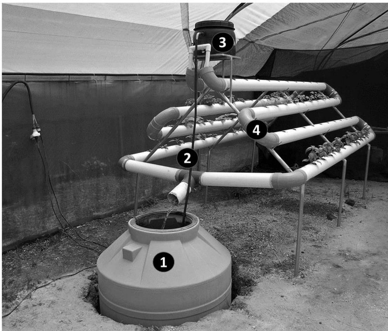
Figure 1. Components of a nutrient film technique (NFT) aquaponic module at the IICAE greenhouse, including (1) water container with a submersible pump; (2) hose to conduct the water from the tank to the biofilter; (3) biofilter; (4) PVC pipe circuits for water circulation and plant hosting.

parametric test of Kruskal-Wallis was used to compare the means values of plant longitudinal growth and biomass production. In this regard, the post hoc test of Mann-Whitney pairwise was run to determine the specific differences. The correlation between survival rate and herb species was analyzed using the Pearson's chi-squared test. Statistical analyses were performed using Past Program®, version 3.20 (Hammer et al., 2001). The significance level for the statistical tests was p < 0.05 .